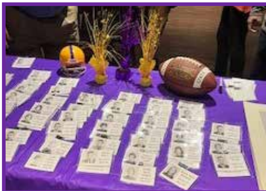
The reunion registration table