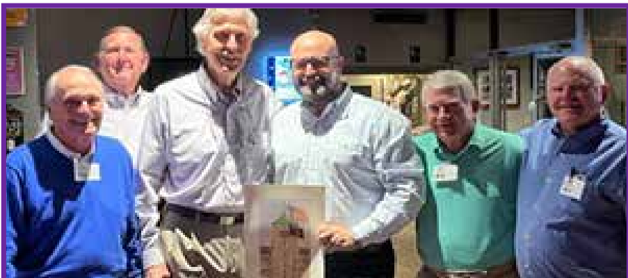
Representatives of the 1961 Championship football team