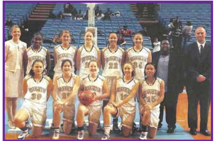
2004–2005 Women’s Basketball Team